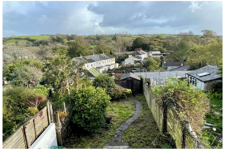
VIEW TO THE REAR FROM FIRST FLOOR